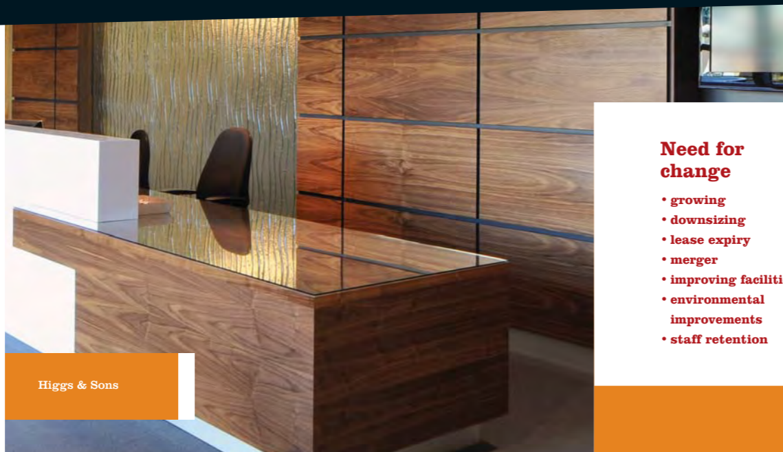
Higgs & Sons

Somewhere in your business something has changed that effects your office needs. It might be a lease break or end, a change in your headcount, a merger or the desire to improve your space.